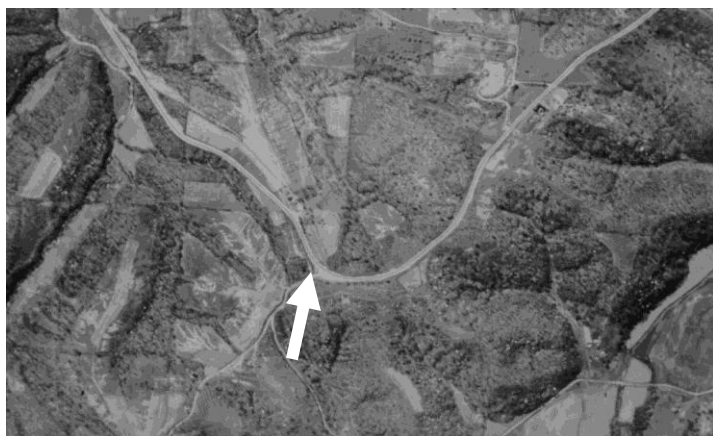
Aerial photograph of the entrance to Morgan-Monroe State Forest -1929)

The State Forest system began with the establishment of Clark State Forest in 1903. Since then, the State Forest system has evolved into 13 State Forests containing more than 150,000 acres. State Forests have been managed for the many forest benefits that these lands are capable of providing. When the state acquired what is now State Forest property, almost every acre was comprised of eroding farm fields, pasture, or cutover timberland considered to have very little value to anyone. Most of the existing woodland had been high-graded, with the residual trees often exhibiting defects from forest fires and livestock grazing.