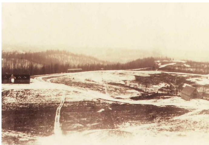
1930 photo of the entrance road at Harrison-Crawford State Forest

State Forests are being managed by professional foresters and resource specialists to demonstrate a working forest concept. A working forest is actively managed under a stewardship plan that guides its activities to accomplish the desired goals. The working forest can provide a variety of goods and services such as watershed protection, recreation, wildlife habitat, scenic beauty and wood products.