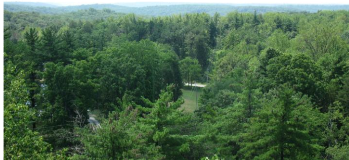
A photo from the same perspective taken in 2012