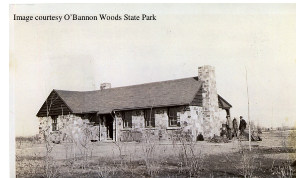
Image courtesy O'Bannon Woods State Park Property Manager's residence, built by the 517th in 1937

The park offers modern electric campsites and primitive and youth camping in the nearby Stagestop Campground. Indiana's first natural and scenic river, Blue River, flows through the state park and forest with a canoe access ramp in Stagestop Campground. The Corydon Capitol State Historic Site is located near the park. Visitors can learn about early Indiana history as they tour the old town square and the beautiful first state capitol building,