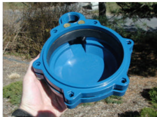
Figure 3. A sanitary well cap showing the rubber gasket, hole for electrical conduit, and screen holes for ventilation.