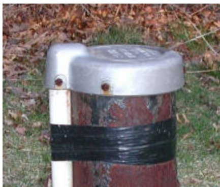
Figure 1. A standard well cap similar to those found on most Pennsylvania wells (note the bolts around the outside of the well cap).

Most existing and new wells in Pennsylvania have a standard well cap similar to the one shown in Figure 1. Standard well caps usually have bolts around the side of the cap that loosely hold the cap onto the top of the casing. The small airspace between the well cap and the casing can allow for insects, small mammals, or surface water to enter the well.