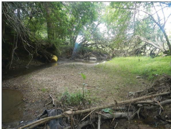
Figure 2. South Fork Wildcat Creek was unhealthy before restoration efforts took place.

From 2005 to 2012, watershed partners conducted education and outreach through stakeholder meetings, public workshops, field days, newsletters, and community cleanups to raise awareness and prompt behavior changes in community members within the entire SFWC watershed community. Workshop topics included information on BMPs such as the use of cover crops, proper septic system management and soil health maintenance. In 2009 Clinton County Soil and Water Conservation District (SWCD) received a CWA section 205(j) grant to prepare a nine-element watershed plan for SFWC. Implementation of the plan began in 2012. So far, landowners have installed a variety of BMPs to improve the health of the SFWC, including cover crops, waste utilization and waste management, well decommissioning, an animal mortality facility, conservation cover, no-till, exclusion fence, pasture and hay plantings, heavy use area protection, stream crossing, nutrient and pesticide management, a watering facility, a manure transfer facility, filter strips and grassed waterways.