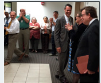
The staff welcomes our attorneys back to the office after a successful oral argument before the Indiana Court of Appeals.