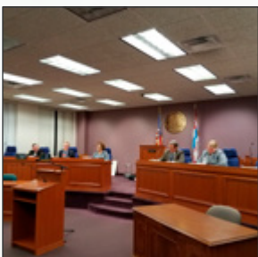
This public field hearing in East Chicago is one of many to be held in pending rate cases.